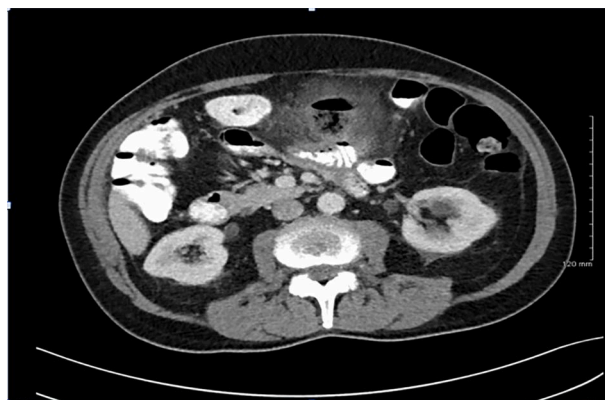
Figure 1: CT findings demonstrating large inflammatory mass related to perforated jejunal diverticulitis.

A 78-year old male presented to the Emergency Department with a 24 h history of sudden onset, generalized lower abdominal pain. Associated symptoms included fever and nausea without vomitus. His past medical history was significant for