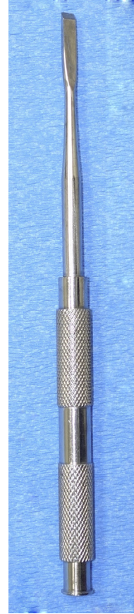
FIGURE 4. Monobevel chisel. The Hartzell and Sons/Denmat SUH3 bone chisel with a 4-mm monobevel stainless steel tip is used for bone removal.

After the crown of the impacted tooth is exposed and before attempted elevation of the tooth, a 4-mm stainless steel bibevel chisel (Fig 5) is used to split the tooth. The tooth should not be luxated before use of a bibevel chisel because this may lead to an unsatisfactory split, mandibular fractures, and fluid splatter. The bibevel chisel is placed in the central groove at a 45° angle along the long axis of the tooth (Fig 6). The surgeon then uses 1 firm strike with the mallet to the bibeveled chisel to section the tooth. This 1 hit is typically enough to fracture the tooth, but sometimes, a second firm strike is required. Immediately after the initial hit, 2 smaller blows with the mallet are taken in the same location to widen the