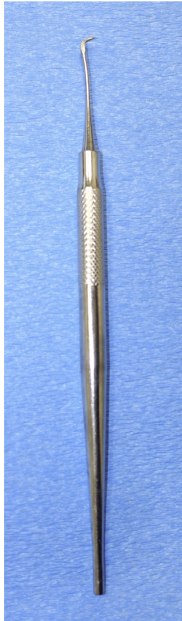
FIGURE 7. Picture of a small hook scaler. A small hook scaler may be used to aid in the removal of fractured roots.

Chien, Steble, and Karian. Chisels in the Extraction. J Oral Maxillofac Surg 2021.