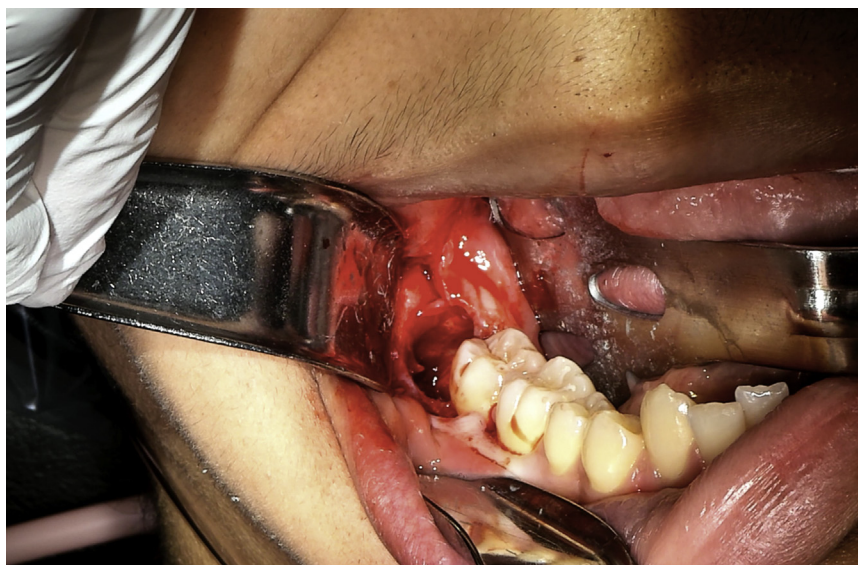
FIGURE 10. Surgical site after extraction of tooth 32. This photograph demonstrates the minimal bone removed and limited soft tissue trauma with using the chisel and mallet technique compared with the traditional handpiece method.

On April 1, 2020, the American Dental Association released an algorithm to minimize the risk of SARS-CoV-2 transmission from emergency and urgent dental patients to health care personnel. In the algorithm, a procedure that did not produce any aerosols only required basic personal protective equipment including a non-N95 surgical mask, eye protection, gown, and gloves and stated that the risk of transmission was low. If there is aerosol production during a procedure, an N95 mask is then required in addition to eye protection, gown, and gloves. 12 The American Dental Association also stated that hand