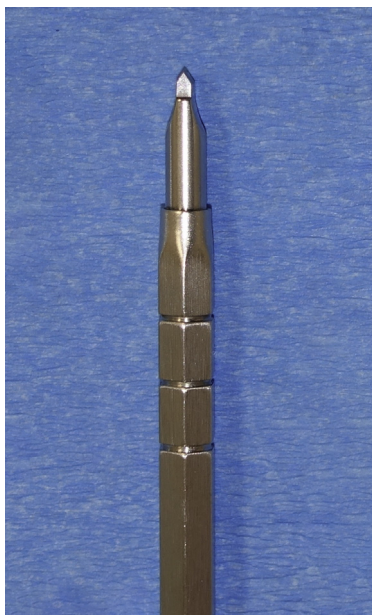
FIGURE 5. Bibevel chisel. This 4mm H & H bibevel chisel is a stainless steel chisel that is used to section teeth. It is a made to order instrument with the reference number 10-5313-04.