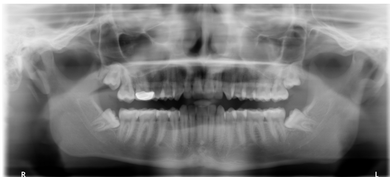
FIGURE 2. Panoramic radiograph. This is a panoramic radiograph of a 19-year-old man with a Pell and Gregory class 1, position B, mesioangular-impacted tooth #32. This is the patient demonstrated in the pictures and video mentioned in this article.

A standard full-thickness mucoperiosteal flap is performed to expose the impacted third molar. The tip of the Molt #9 elevator is then used to remove the thin alveolar bone around the coronal aspect of the impacted third molar. If the buccal bone is too thick to remove with the Molt #9 elevator, then a 4-mm stainless steel monobevel chisel and mallet are used (Figs 3, 4). The monobevel chisel is placed at the mesiobuccal aspect of the impacted tooth with the bevel against the buccal bone aiming distally and is advanced slowly to remove the occlusal buccal bone with a mallet using