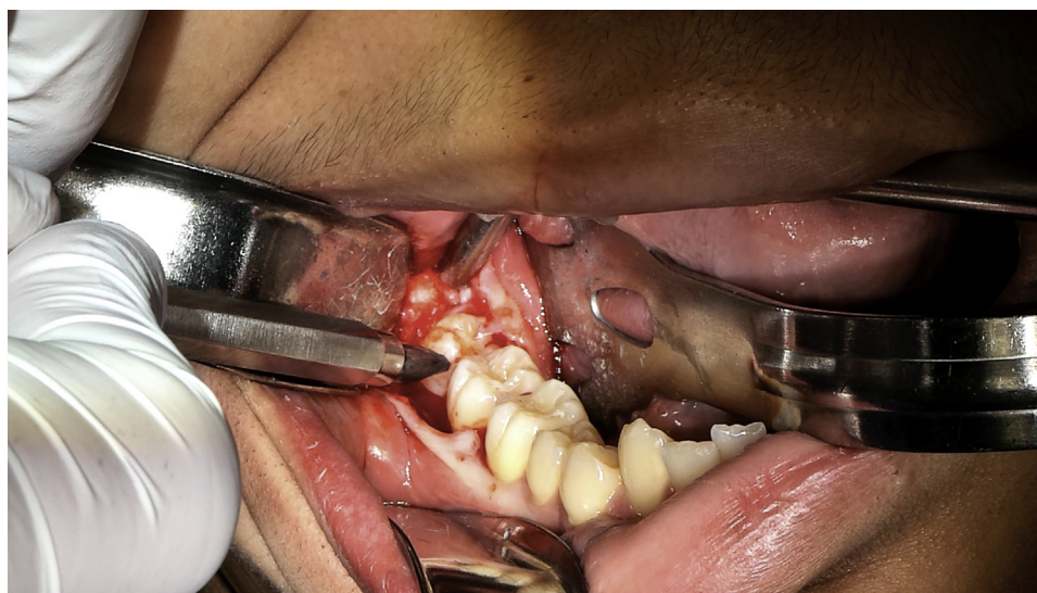
FIGURE 6. Proper placement of the bibevel chisel for splitting of the mandibular third molar. The bibevel chisel is placed in the buccal central groove at a 45° angle to the occlusal buccal line angle along the long axis of the tooth.

“The primary objective in any form of surgery is to perform the operation successfully, skillfully, and as rapidly as possible with minimum amount of trauma to contiguous tissues.” 2 The use of chisels can be