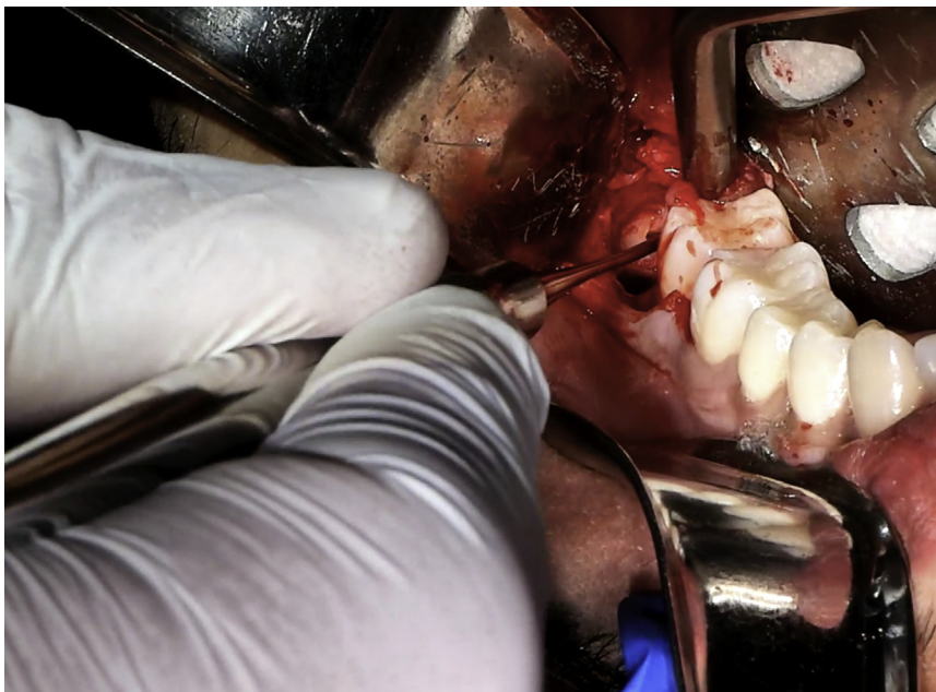
FIGURE 8. Use of a small hook scaler for removal of a fractured root tip. This is a clinical demonstration of the placement of the small hook scaler for removal of the fractured root tip in the pulp canal.

In addition to likely preventing aerosolization because the procedure is being fully performed by hand instrumentation, there are several other advantages of the chisel and mallet technique in exodontia over the commonly used rotary handpiece. The proper use of chisels and mallets has the advantage of surgical speed and minimal trauma to the adjacent soft tissues. A rotary handpiece has a risk of causing soft-tissue lacerations to the tongue, lip, and/or cheeks and may also cause burns. The rotary handpiece can also cause damage to the adjacent teeth. A discussion was held with a national liability insurance carrier specializing in coverage of OMSs confirming that bur and handpiece injury to soft tissue and damage to adjacent teeth are common claims. It is known that a bur passing through the lingual plate of the mandible while sectioning an impacted mandibular third molar can cause injury to the lingual nerve. On occasion, the lingual plate may crack from the impact when the mallet and chisel is used to section a mandibular third molar. There is little concern of lingual nerve