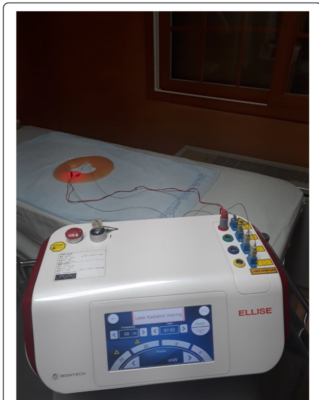
Fig. 3 The intervention will be performed with medical device of invasive laser acupuncture needle, low-level laser, and electrical stimulator (Ellise)

changed according to the judgment of the PI or the request of the participant.