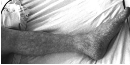
Figure 6. Livedo reticularis.

has been proposed that these chilblains may result from a delayed immune response (Gisoni et al., 2020; Seirafianpour et al., 2020).