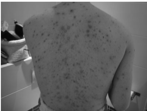
Figure 3. Vesicular rash.

Another dermatologic finding that has been reported is skin color changes to the distal extremities, similar to chilblains (see Figures 4 and 5; Gottlieb & Long, 2020; Ladha et al., 2020). Chilblains, sometimes called pernio or kibes , are usually caused by cold exposure and result from vasoconstriction (Gottlieb & Long, 2020; Ladha et al., 2020). Other reviews report that acral lesions, or