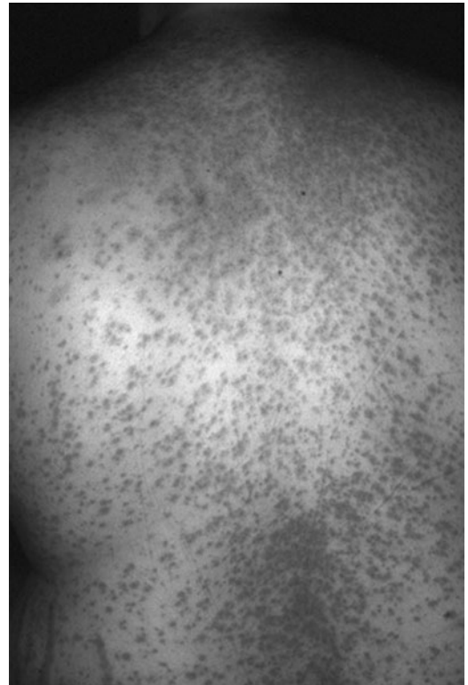
Figure 1. Maculopapular rash.

According to Sachdeva et al. (2020) and Seirafianpour et al. (2020), the most common rash reported was a maculopapular rash (see Figure 1), sometimes referred to as a mor-