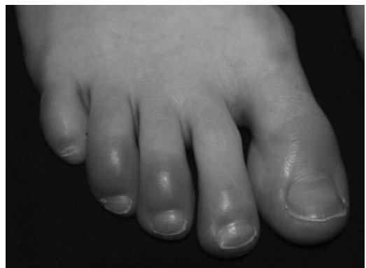
Figure 5. Chilblains.

chilblain-like lesions, were the most common dermatologic manifestations encountered in CoVID-19 patients (Daneshgaran et al., 2020; Gisondi et al., 2020). These findings have been coined by some as “CoVID toes” and may be encountered in patients with no other symptoms and are usually late presentations in mild cases of CoVID-19 (Ladha et al., 2020; Seirafianpour et al., 2020). Based on several reports, CoVID-19 chilblains are usually asymmetrical, are more common in younger patients, and mainly affect the feet (Daneshgaran et al., 2020; Gisondi et al., 2020; Ladha et al., 2020). Unlike typical chilblains, it is thought that CoVID-19 chilblains are less likely the result of ischemia or thrombosis (Ladha et al., 2020; Seirafianpour et al., 2020). Furthermore, it