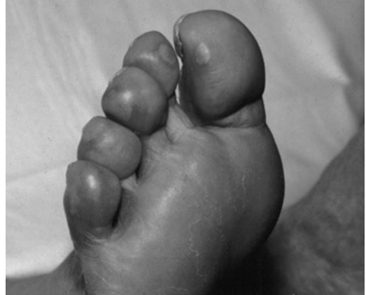
Figure 4. Chilblains.

chilblain-like lesions, were the most common dermatologic manifestations encountered in CoVID-19 patients (Daneshgaran et al., 2020; Gisondi et al., 2020). These findings have been coined by some as “CoVID toes” and may be encountered in patients with no other symptoms and are usually late presentations in mild cases of CoVID-19 (Ladha et al., 2020; Seirafianpour et al., 2020). Based on several reports, CoVID-19 chilblains are usually asymmetrical, are more common in younger patients, and mainly affect the feet (Daneshgaran et al., 2020; Gisondi et al., 2020; Ladha et al., 2020). Unlike typical chilblains, it is thought that CoVID-19 chilblains are less likely the result of ischemia or thrombosis (Ladha et al., 2020; Seirafianpour et al., 2020). Furthermore, it