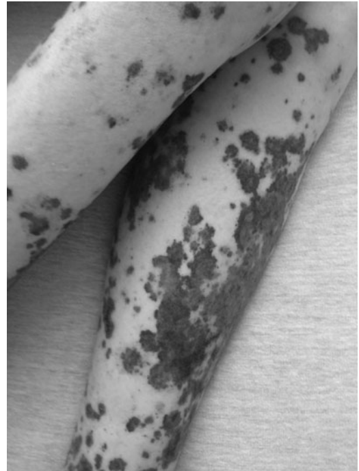
Figure 7. Petechial rash.

Even with a positive SARS-CoV-2 test, other differentials should be considered for dermatological findings. These may include autoimmune conditions such as lupus, vasculitis, environmental exposures, other viral pathogens, for example, herpes simplex and herpes zoster, medications, and malignancy to name a few (Ladha et al., 2020; Seirafianpour et al., 2020). Treatment for these dermatological changes associated with CoVID-19 is usually supportive. Topical steroids may be used to provide anti-inflammatory benefits, though this is not proven in CoVID-19 patients (Ladha et al., 2020). Pruritus may be treated with anti-