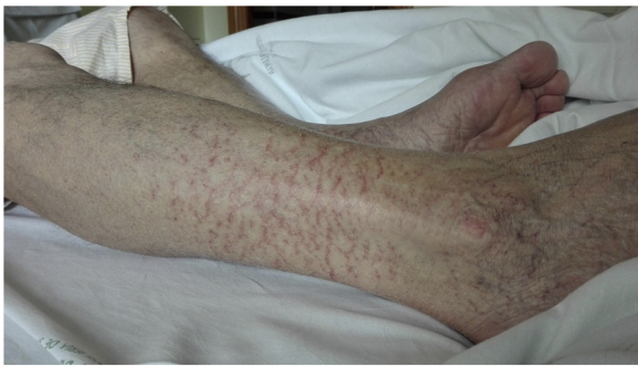
Fig. 2. Patient 2: Mild vasculitis lesions in distal legs after CCP transfusion.