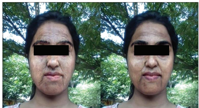
Figure 2: The illustrations of age change by the software

The mean scores of the opinions of the effects of smoking on