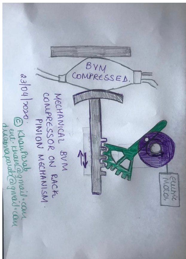
Fig. 3 Alternate model for mechanical Bag Valve Mask compression

Our BVM compressor is driven by motor. We use the motor used for Wind shield wiper whose speed can be