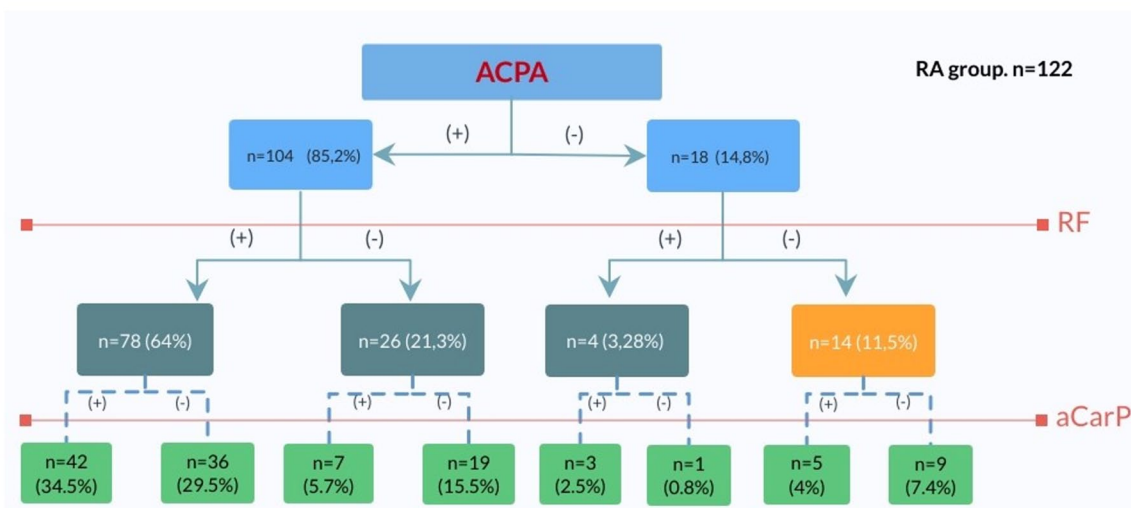
Figure 3. The decision tree. The group of 122 RA patients divided into subgroups according to ACPA, RF and anti-CarP positivity presented as number of patients and percentage. ACPA, anti-citrullinated protein antibody; aCarP, anticarbamylated proteins antibodies; RA, rheumatoid arthritis; RF, rheumatoid factor.

ACPAs from a wide range of anti-citrullinated antibodies generated during the epitope spreading process. 45 Therefore, there are two ways to