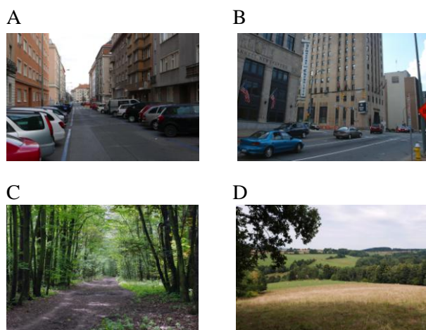
Figure 1. Examples of stimulus material. A, B - urban scenes, C, D - natural scenes.

Images. All images used in this study were taken by one of the authors using a digital camera (Nikon D90) with a wide-angle zoom lens. They were composed of images of cities or natural scenery (see Figure 1). All images were transformed to 1152 \times 768 pixel resolution using the Adobe Photoshop CS 6 software. Each image was individually optimized. The images had their brightness levels and contrast balanced using the “Auto Levels”, “Auto Contrast”, and “Auto Colors” options in Adobe Photoshop. Twelve images were photographs from cities in the Czech Republic (Beroun, Chlumec nad Cidlinou, Prague, Uherský Brod), Belgium (Brussels) and the United States (Seattle). The urban scenes had a diverse character. Some of them contained high-rise buildings (Seattle), whereas others were streets with typical urban buildings from the 19th century (Brussels, Prague) or streets with low-rise buildings typical of small towns (Beroun, Chlumec nad Cidlinou). The next 12 images with natural scenes were taken in the Czech Republic. They consisted of conifer or deciduous forests, meadows, or ponds. There were no people in any of these images.