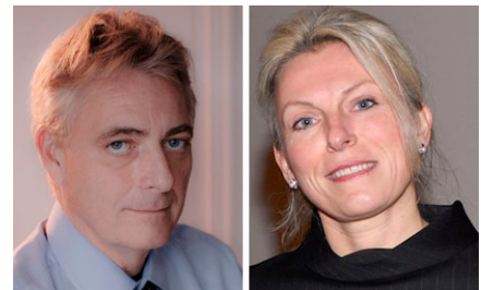
Insights from Guido Kroemer and Laurence Zitvogel.

Later, James Allison’s group reported in 1999 (van Elsas et al., 1999) the possibility to treat mice bearing established B16-BL6 melanomas by a combination of CTLA-4 blockade and immunization with irradiated tumor cells engineered to express GM-CSF. Although this type of combination therapy has not been Food and Drug Administration approved, each of the elements of this strategy has separately led to three medical applications: (1) CTLA-4 blockade as the first example of clinically approved ICI for the treatment of stage III and IV melanoma (Hodi et al., 2010); (2) the a posteriori realization that radiotherapy (and thereafter other cytotoxic compounds) can induce immunogenic cell death (ICD) in malignant cells, thus causing anticancer immune responses that explain its long-term benefits and synergy with ICI (Apetoh et al., 2007); and (3) the use of a GM-CSF-producing oncolytic virus (talimogene laherparepvec, best known under the acronym TVEC) that has been clinically approved for the