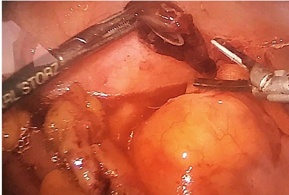
FIGURE 3: Intraoperative view of necrotic epiploic appendage before resection.