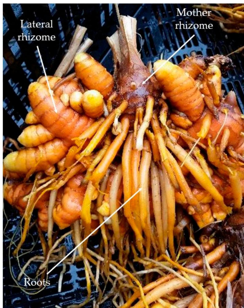
Figure 1. Underground parts of Curcuma longa showing the rhizomes and roots.

pear-shaped in the center (Figure 1). The branches of mother rhizomes are the secondary rhizomes, called lateral or “finger rhizomes” [11]. The mother rhizomes are more matured than finger rhizomes, therefore containing higher curcuminoid concentrations and perhaps higher essential contents than finger rhizomes. However, the curcumin yield from finger rhizomes is higher than that from mother rhizomes [12].