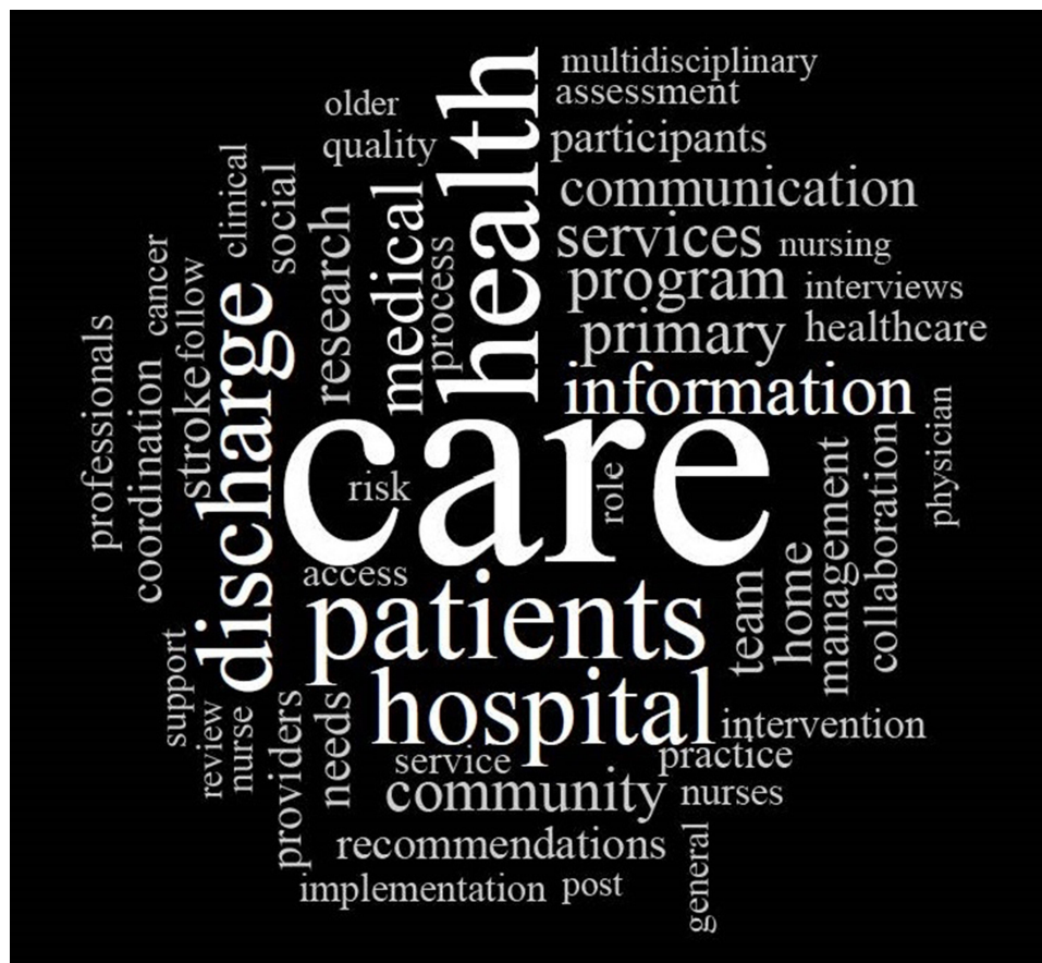
Figure 2 Word cloud of 50 most frequent words.

a contributing factor, 38,51,54,55 resulting in one-way communication, 51 with hospital discharge summaries often not received in time to be relevant to primary care practitioners 53,59 and/or without establishing a shared understanding by determining if the information is according to need and/or understood. 54