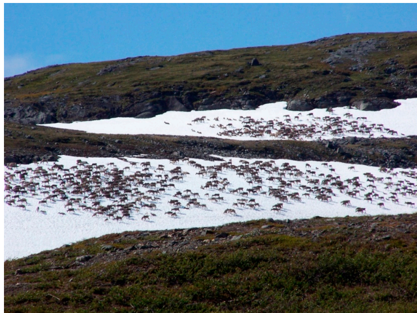
Figure 2. Free-ranging reindeer in their summer grazing lands, in Sarek National Park, Sweden.

Even though the atypical CWD hypothesis reassures reindeer herders, they are obviously worried about the possible consequences of CWD cases in their herds. The culling in Nordfjella created a dramatic precedent for them, a sword of Damocles poised over their herds. Beyond reindeer herders, all the stakeholders we interviewed agreed on the fact that, if it happens, the impact of CWD on reindeer herding would be catastrophic for the reindeer herding industry and for Sami culture. CWD in Sami reindeer husbandry would have disastrous outcomes. A herder with an infected reindeer would lose all his herd, including all the reindeer of his family and other members of the community, and would probably have to quit this activity because of the possible contamination of the environment and the difficulty of starting a new herd (pers. comm., interview 6, 7, 12, 13). Also, for the herders we talked to, a case in reindeer herding might mean that it is already too late because the reindeer mix with each other and move a lot (Figure 2). For them, a case would imply existing spread of the disease (pers. comm., interviews 7, 9, 11, 12, 13, 14, 18). For the SSR representative, the Nordfjella strategy consisting of 'cleaning' an area of CWD would not work in the reindeer herding context because of the herds mixing with each other, especially in summer, and because of seasonal migrations (pers. comm., interview 18).