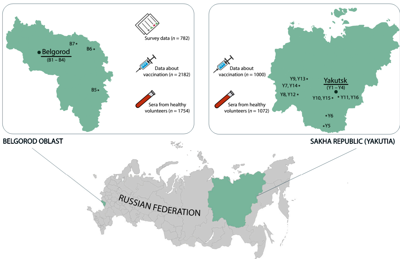
Figure 1. Study regions (in green) with indicated centers in each region where data on vaccination coverage were collected (B1 to B10—centers in Belgorod Oblast, Y1 to Y16—centers in Yakutia). The capital of each region is underlined. The number of participants in each step of the study (newborn vaccination coverage, serosurvey, survey of university students and teachers) are indicated in the callouts.

coded and stored in aliquots at -70\text{ }^{\circ}\text{C} until testing. After thawing, sera were tested for the serological markers of HBV infection (Figure 1).