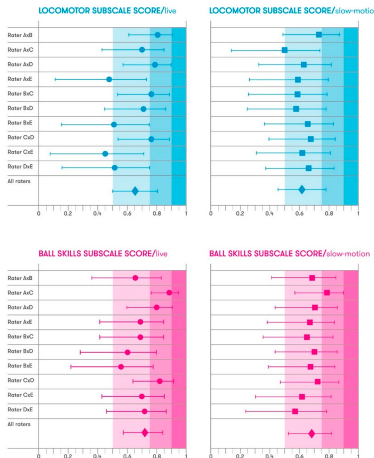
Figure 1. Cont.

Regarding ball skills, the two-hand strike was the skill with higher inter-rater reliability, ranging between poor-to-good and moderate-to-excellent. The two-hand catch was the skill with the lower inter-rater reliability.