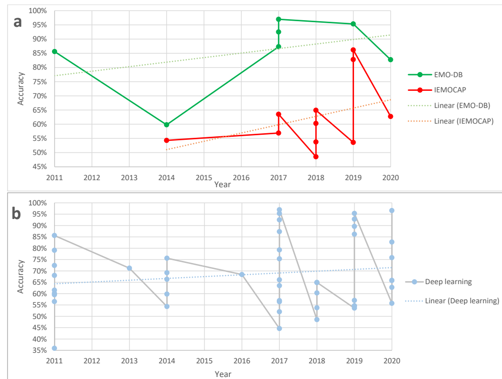
Figure 2. (a) Comparison of reported accuracies based on EMO-DB, IEMOCAP, and all databases used in deep learning methods and their trend lines. Dots in solid lines are showing all the accuracies reported and the dotted line shows the linear trendline of reported accuracies. (b) Aggregation of all the accuracies reported in deep learning methods.

Additionally, Figure 2a shows a comparison between accuracies reported in deep learning methods based on EMO-DB versus IEMOCAP, which we can see there is a clear separation between the accuracies published. Again, one reason could be the fact that EMO-DB has one degree of magnitude fewer number of samples than IEMOCAP, and using it with deep learning methods makes it more prone to overfitting.