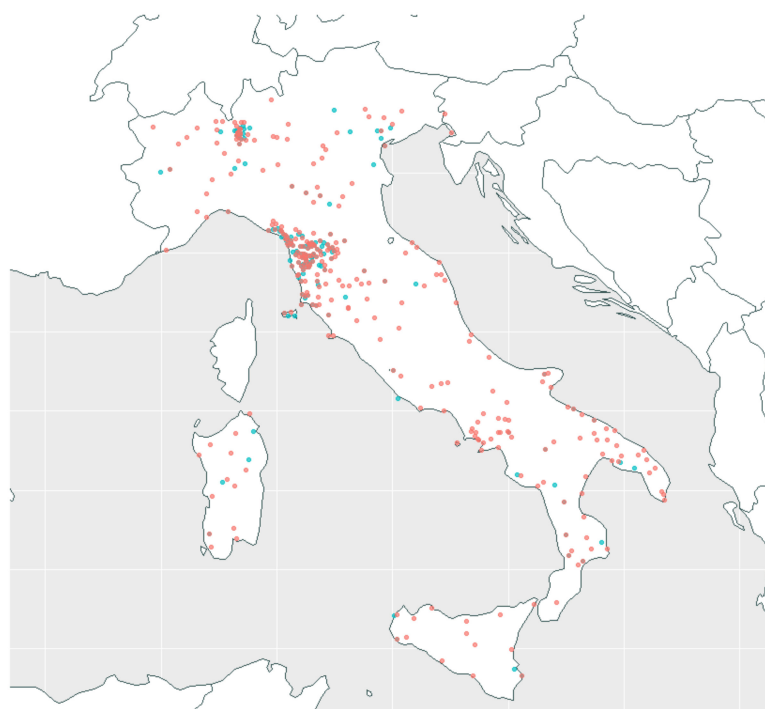
Figure 2. Map of municipalities of residence (207, in blue) and places of birth (407, in red) of screened subjects.

A total of 2238 subjects, from 207 different municipalities of residence and 407 places of birth throughout Italy (see Figure 2), were screened: 835 men and 1403 women. The average age was 43.18 years, with a standard deviation of 18.34. About 70% were between 25 and 65 years of age.