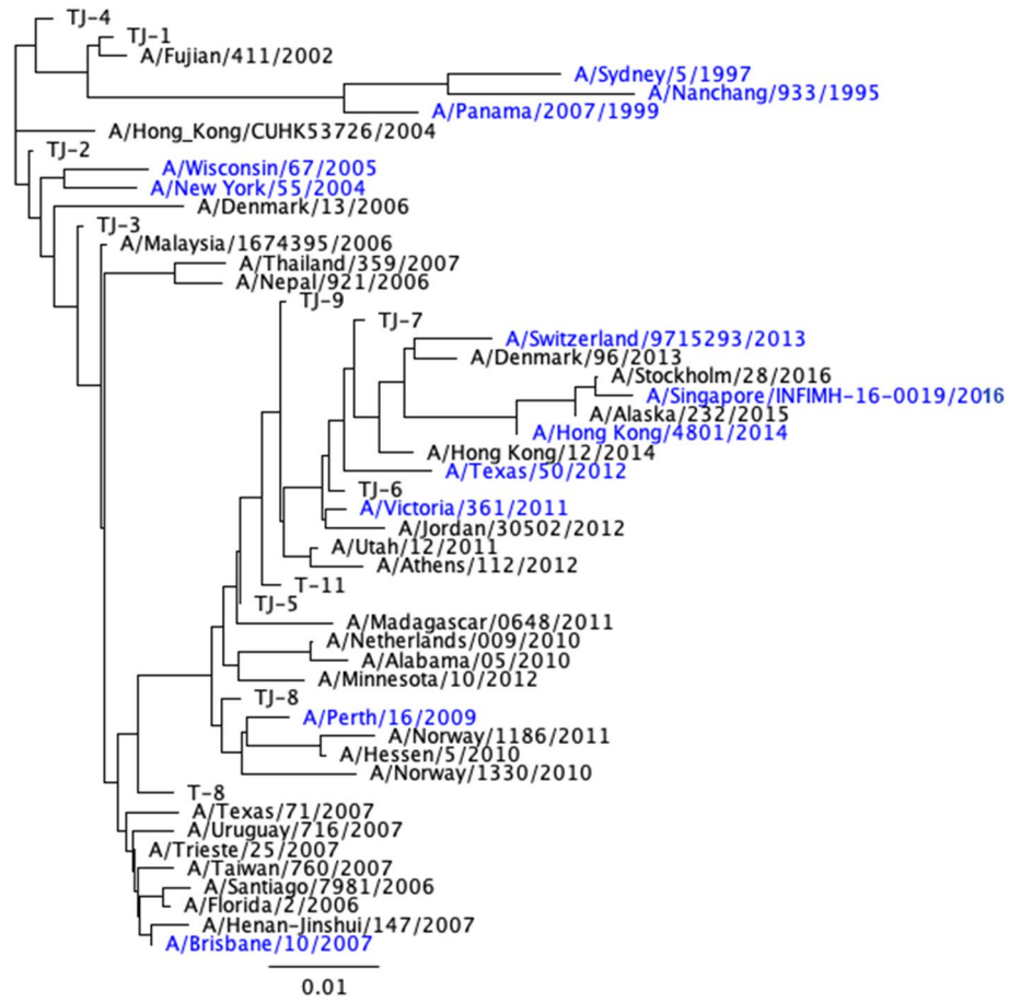
Figure 2. Phylogenetic tree of next-generation COBRA and wild-type H3 HA antigens. The rooted (A/Nanchang/933/1995) phylogenetic tree was inferred from next-generation H3 HA and wild-type H3 HA amino acid sequences derived from representative A(H3N2) influenza viruses isolated from 1995 to 2016 that were obtained from the GISAID EpiFlu online database. Sequences were aligned with MUSCLE 3.8.425 software, and the alignment was refined by Gblocks0.91b software. Phylogeny was determined using a Jukes-Cantor genetic distance model and a neighbor-joining tree building method using Geneious bioinformatics software. Trees were rendered using Geneious tree builder software 55 . Wild-type vaccine strains are highlighted in blue.