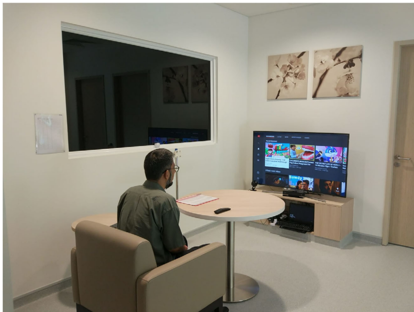
FIGURE 2 Figure showing a seated participant watching television. Note the one-way mirror to the left of the participant

identifiable data/feature were recorded, thereby preserving the privacy of each participant. One contact sensor (Door/Window Sensor Gen5, Aeotec, USA) was mounted on the telephone handset (for participant's use) within the smart home and another contact sensor was mounted on the assessor's telephone handset. A telephone list was placed on the table. A contact sensor-equipped coin box was placed on the table for the calculating cost task. A large 55-inch television screen was used to show participant's a digital shopping inventory (Figure S1) for the calculating cost task.