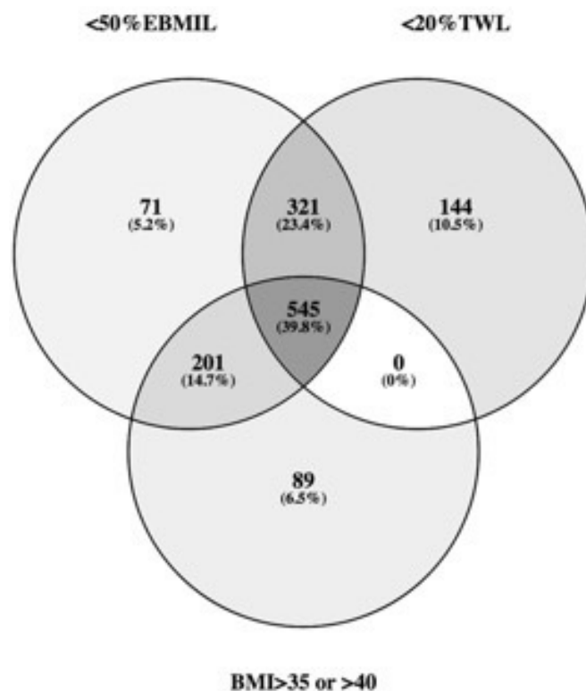
Figure 2 Venn diagram of the prevalence of developing surgical treatment failure 5 years postsurgery according to three definitions: %excess BMI loss ( n=1138 ), BMI >35 or >40 ( n=835 ) and <20% total weight loss ( n=1010 ). BMI, body mass index; EBMIL; excess BMI loss; TWL, total weight loss.

Surgical treatment failure was more common among patients with inadequate weight loss (60% vs 15.4%, p<.001 ) and early weight regain (33.8% vs 15.6%, p<.001 ). Comparing long-term weight regain, the proportion meeting criteria for failure was highest in participants