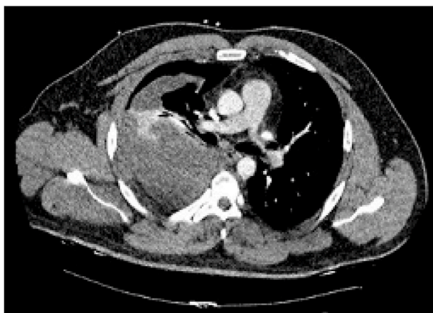
Fig. 2. CT chest revealing loculated pleural effusion and lobar collapse.