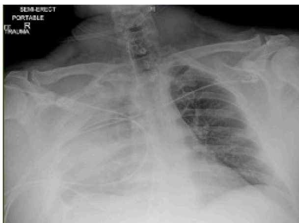
Fig. 1. Chest x-ray with complete opacification of the right hemithorax