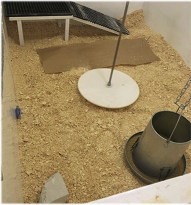
Figure 1. Enrichments within pens. Enrichments provided included a ramp with 25° incline to a platform 30 cm above the floor, a hanging scale, PECKStone mineral block (cut into ¼ of its original size), and hanging (blue) polyester cloth along one wall. Water lines (not shown; they were lowered prior to bird placement) were equipped with 5 nipple drinkers. Round pan feeders were provided with all vegetarian, antibiotic-free feed. Wood shavings were used as litter substrate. Brown paper with scattered feed was provided for the first week of life to aid chicks in finding feed and water. Above the pen walls, netting was affixed to a wooden frame to prevent birds from jumping out of their pens.

to 31°C on day 5. At the start of weeks 2 to 5, room temperature was reduced incrementally, until 21°C at week 5.