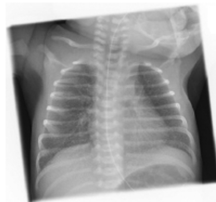
Fig. 2. Chest X-ray of the neonate on day one shows radiologic signs of mild respiratory distress syndrome (RDS).

Pressure controlled mechanical ventilation was applied with a lung protective strategy according to current guidelines on ventilation for patients with ARDS including deep sedation, intermittent prone position and administration of neuromuscular blocking agents [4–6]. On admission day 15, continuous iNO at 20 ppm was added due to the increasing oxygen need. The patient was treated with continuous iNO for five days at gradually reducing concentration; nevertheless, the NIH do not recommend routine use [7]. To minimize fetal exposure, the patient was treated with 40 mg prednisolone daily from two days prior to birth