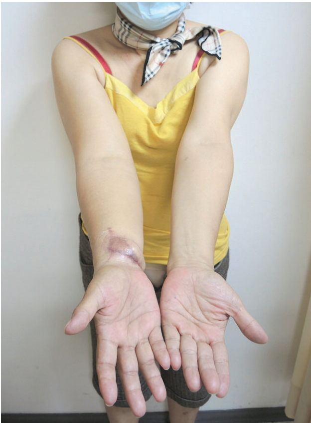
Figure 2 Nine-month postoperative picture after delayed skin grafting for lymph node flap transfer (LNFT). Delayed split skin grafting allows reduced graft requirement, leading to better aesthetic outcome. Further improvement can be achieved by scar revision after 1 year of primary surgery.

of the skin graft is avoided. Fortunately, in our study, we did not encounter such a scenario. Another interesting benefit is the avoidance of any issues arising out of ex vivo storage, which may not comply with the strict norms laid down for skin and tissue preservation by various regulatory authorities. It eliminates potential complications like clerical errors, contamination and wrong patient graft application, which may occur in scenarios where the graft is stored ex vivo in the hospital's skin banks. An additional advantage derived from this method is the cost effectiveness. The primary procedure is shortened by reducing the time required in graft inset and the delicate graft dressing. Moreover, the delayed procedure can be easily managed at the bedside in simple analgesia cover, thus avoiding the operation theatre and anaesthesia expenses. The analgesia requirement for the skin graft donor site is reduced as the graft itself acts as a biological dressing. Some patients may, however, be uncomfortable to have an additional procedure, especially when performed without complete anaesthesia. Yet, we firmly believe that this combined technique is largely comfortable and safe for most of the patients and allows flexibility in the coverage of the donor site while providing additional security against tension and compression of the flap pedicle in the critical early postoperative period.