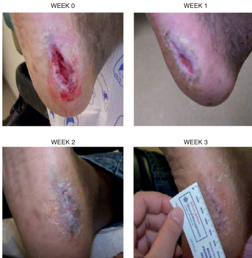
Figure 3. Patient 3 had a 4.0 × 1 cm diabetic ulcer on the left heel. After 3 weeks of PRFE treatment the ulcer had completely healed. The ulcer is shown at weeks 0, 1, 2 and 3.