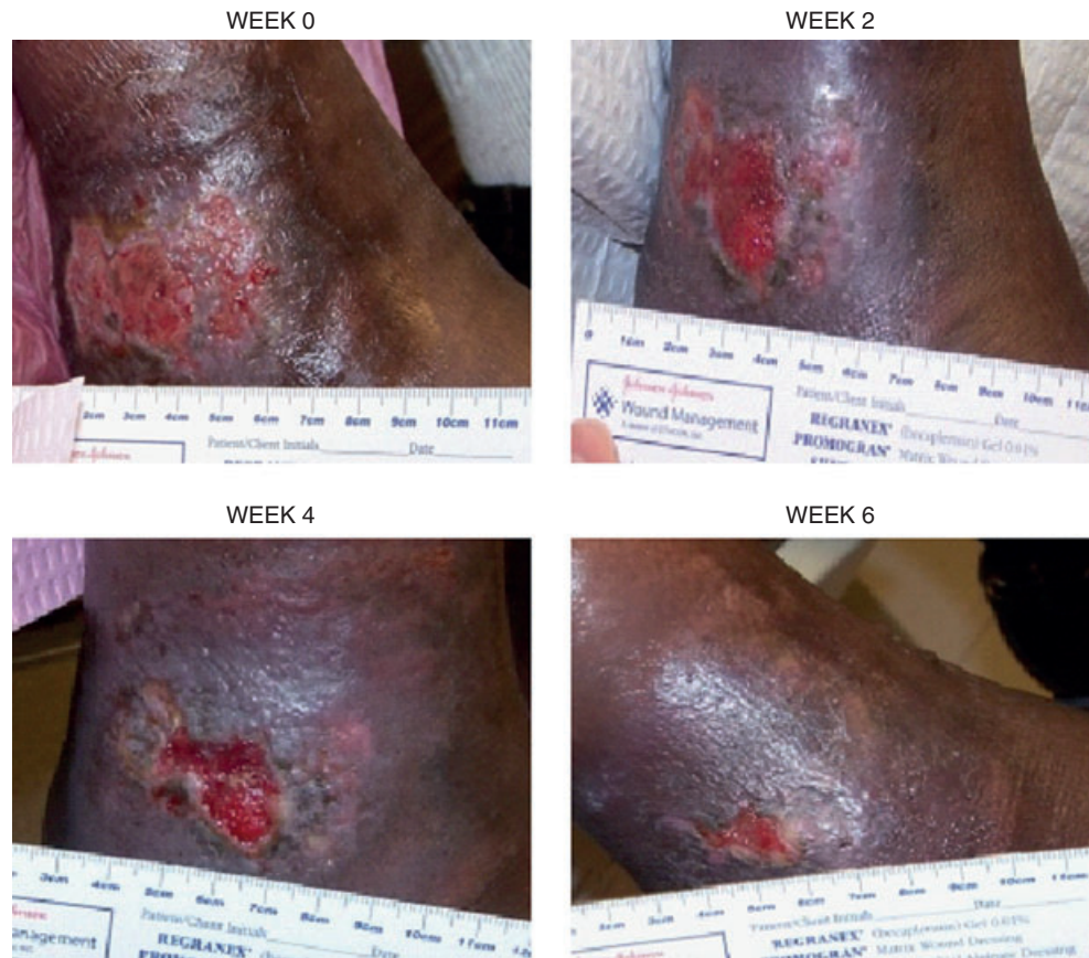
Figure 1. The venous stasis ulcer of patient 1 is shown at weeks 0, 2, 4 and 6 of PRFE treatment. Significant pain relief was reported by the patient after 2 weeks treatment. The ulcer had decreased in size from 4.0 × 2.5 cm to 0.7 × 0.5 cm after 6 weeks PRFE treatment. The ulcer continued onto healing using the PRFE therapy.