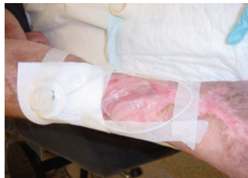
Figure 5. A version of the PRFE device is shown in use on a patient with a venous stasis ulcer.

and 1000 Hz pulse rate. Figure 4 shows the latest version of the PRFE device and Figure 5 shows the application of the PRFE device on a patient with a venous stasis ulcer; prior to PRFE therapy this patient was considered for