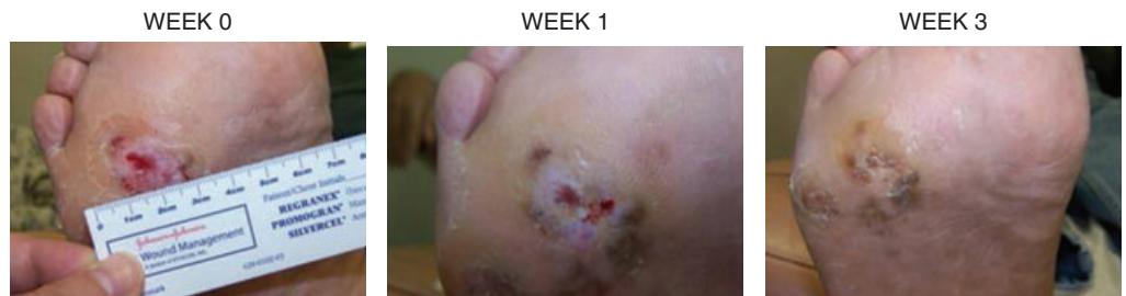
Figure 2. Patient 2 had a 0.5 × 0.5 cm diabetic ulcer at the beginning of PRFE treatment, which healed after 3 weeks PRFE therapy. The ulcer at weeks 0, 1 and 3 is shown.

used 3 hours per day. More recently clinical trials on the postoperative recovery after breast augmentation surgery (18) and breast reduction surgery (19) have clearly demonstrated the control of postoperative pain with newer versions of wearable, portable PRFE devices.