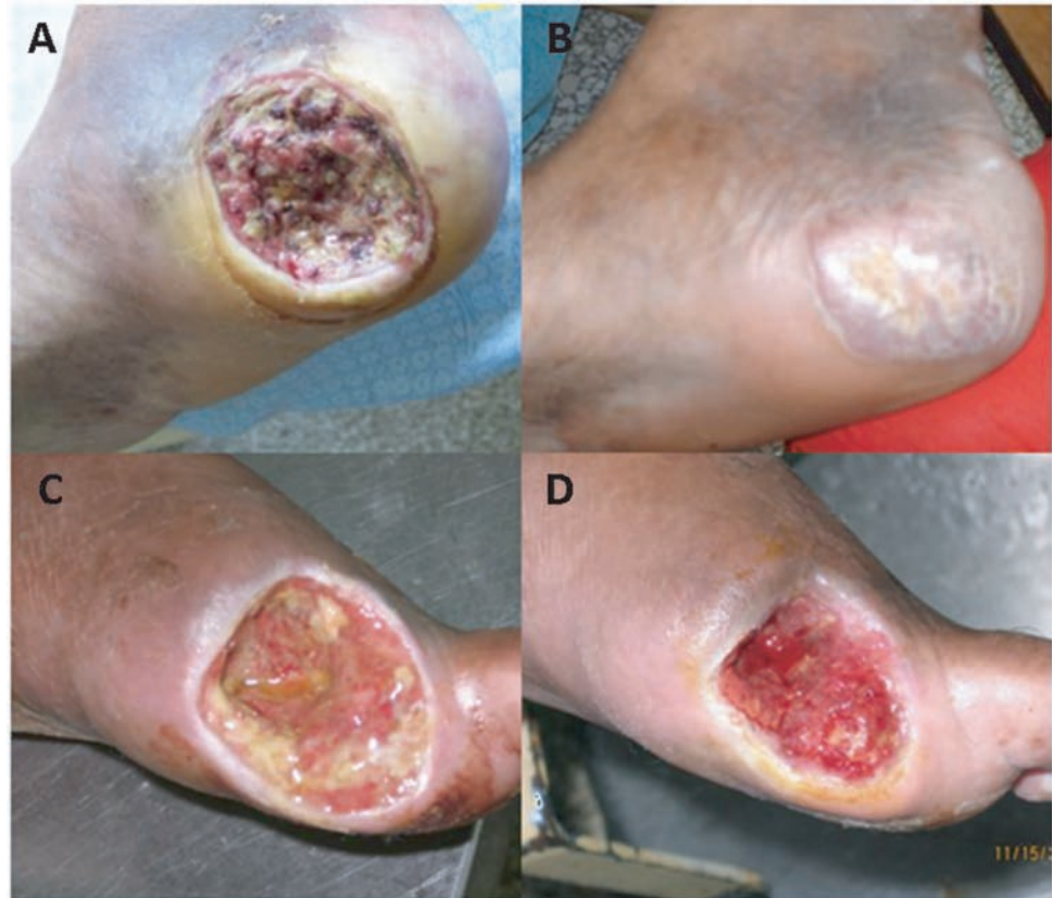
Figure 2. Examples of lesions treated with intra-lesional EGF. (A) calcaneus, Wagner's 3, 21.4 cm 2 ischaemic ulcer in a 52-year-old man. Note the epithelial hypertrophic edges and necrotic bed before treatment. After 16 instillations (5 weeks), the patient reached complete granulation. (B) Healing was further completed in 20 weeks. (C) First toe disarticulation residual base in a 70-year-old neuropathic man, refractory to heal for 12 months. (D) Complete productive granulation, evidence of contour contraction and incipient epithelial migration were achieved after six instillations (2 weeks). This patient finally healed completely after 19 weeks.