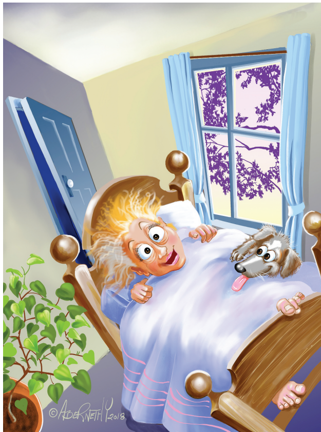
Figure 6. Lucky . Reproduced with permission of the artist, Jean Abernethy.