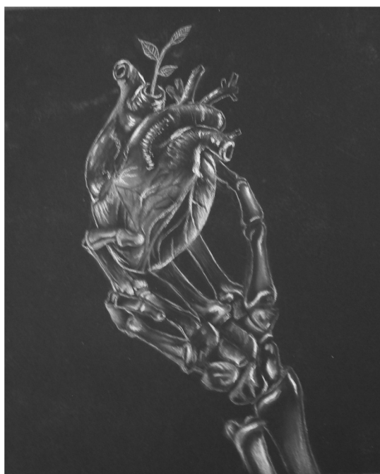
Figure 1. Skeleton Heart . Reproduced with permission of the artist, Melanie Prentice.

recognizing the symptoms permits a way up and out to regain and begin a road to better heart health.