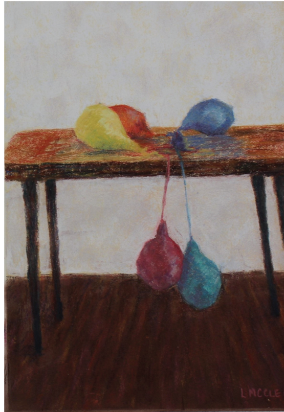
Figure 5. Running on Empty . Reproduced with permission of the artist, Lynn McCleary.

The poem “Lucky” describes an individual navigating this experience and provides a heightened understanding of the complex experience of eventual pain-related symptom recognition.