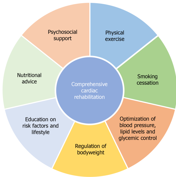
Figure 1 Comprehensive cardiac rehabilitation and its core components. Programs of cardiac rehabilitation support patients in goals of increasing levels of physical activity, healthy nutrition, optimal adherence to medication, body weight regulation, smoking cessation, and optimal psychosocial well-being, thereby helping them to reduce the risk of recurrent cardiovascular event.

segment changes; e.g. , during exercise stress testing), and any presence of uncontrolled cardiac arrhythmias as well as by other diagnostic tests that could be considered as relevant (on a case-by-case basis by the attending physician) [27,35,38] .