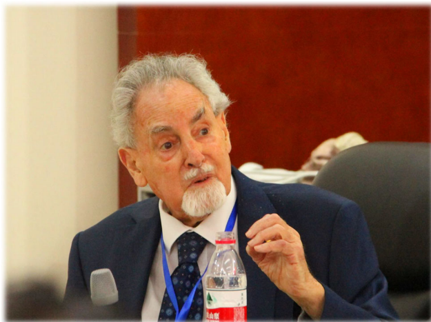
Fig. 4 The opening lecture addressed by Geoffrey Burnstock at the 1st Chinese Purine Meeting in Chengdu, 2018