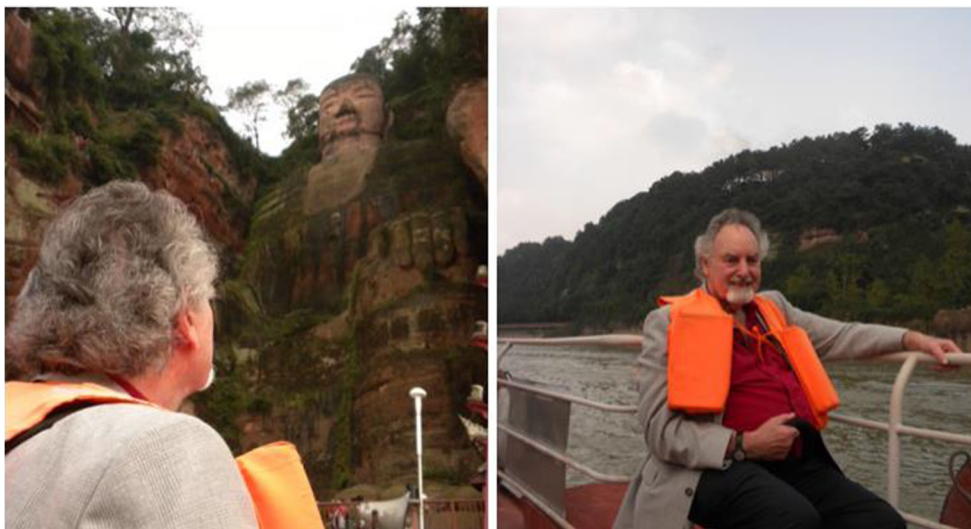
Fig. 5 Geoffrey Burnstock visited Leshan Giant Buddha in 2012

(Hungary), where I had been working at the Department of Pharmacology of the Semmelweis University of Medicine for 10 years after graduation from Medical School. I was deeply impressed by Geoff's talk and was able to present to him my poster on sympathetic transmission in the guinea-pig vas deferens, which he criticized in a friendly, but decisive manner, and in the retrospect, quite correctly.