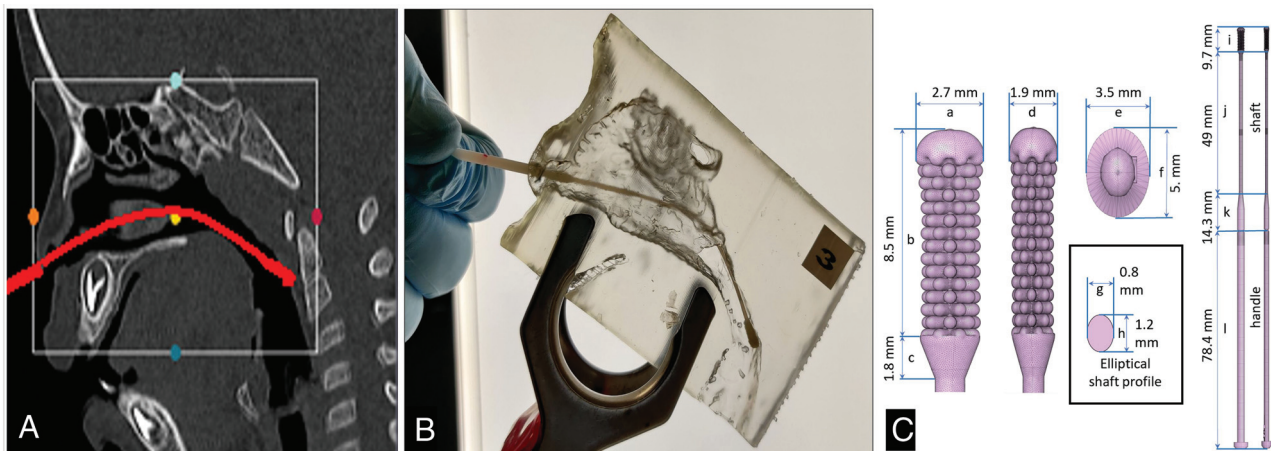
FIG 1. A, Sagittal section of a maxillofacial CT scan of a 22-month-old patient. Shown in red is the trajectory of a virtually inserted swab reaching the posterior nasopharynx. The white box shows the portion of the anatomy chosen to print the nasopharyngeal passage. B, A commercial flocked pediatric swab (COPAN Flock Technologies swab) reaching the posterior nasopharynx within the 3D-printed nasopharyngeal passage. C, Design of the elliptical-section 3D-printed pediatric swab (Design ES).