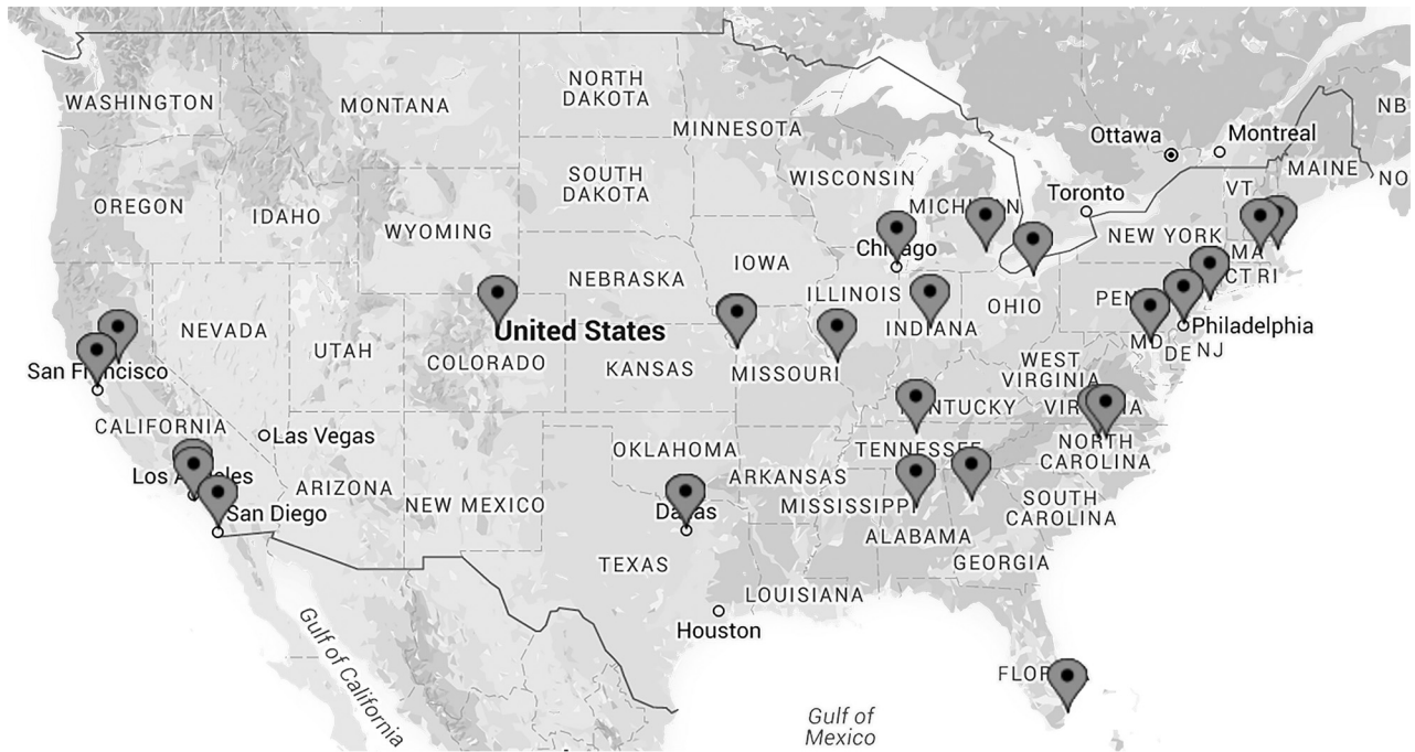
FIGURE. Locations of stroke centers responding to the survey.

tices by conducting a nationwide survey of practices in effect at experienced stroke centers, identify highly consistent workflow steps that may indicate general agreement on best practices in real-world conditions, and recognize areas of greater workflow variability that may suggest that such a consensus has yet to emerge.