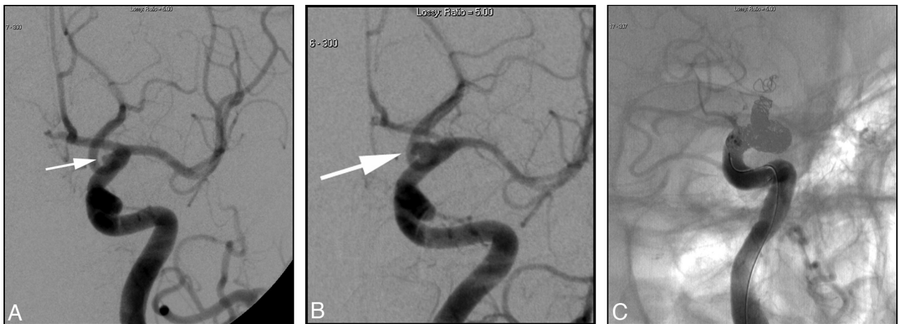
Fig 4. Left supraclinoid ICA blister aneurysm. Preprocedural DSA (A) shows a blister aneurysm ( white arrow ) along the medial wall of the supraclinoid segment of the left ICA. Subsequent DSA (B) shows enlargement of the blister aneurysm ( white arrow ). Due to the repeat hemorrhage and increase in the size of the aneurysm, the patient was treated with parent vessel occlusion (C) and aneurysm trapping (after passing a temporary balloon occlusion).

reevaluated with short-term follow-up DSA (within a few days). The reasoning for this decision stems from the concept that blister aneurysms tend to enlarge and change configuration rather rapidly. Three of our patients (50%) fell into the “suspicious but not definitive” category, all showing increase