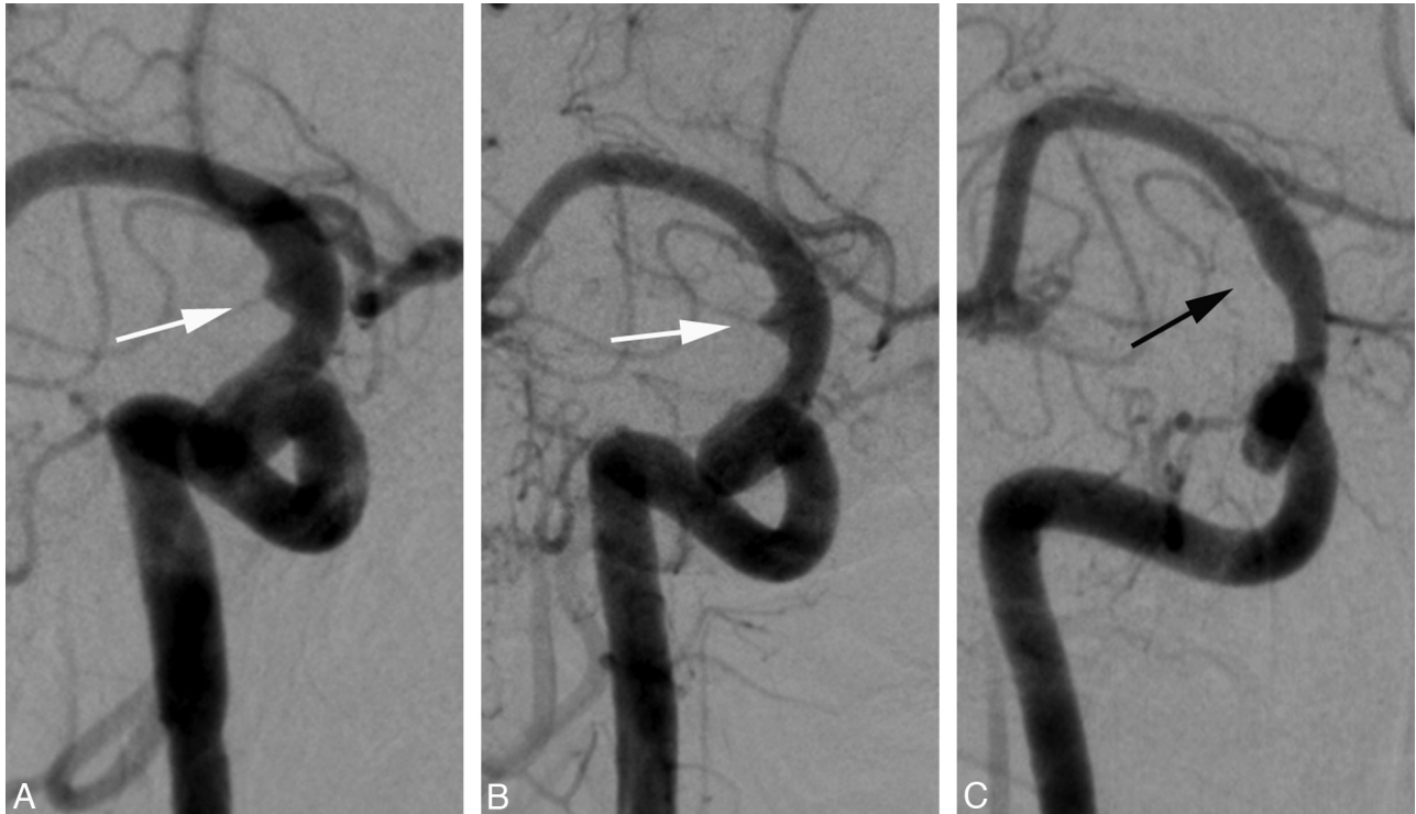
Fig 2. Right supraclinoid ICA blister aneurysm. Preprocedural DSA (A) shows a shallow outpouching (white arrow) arising from a nonbranching site along the anterolateral wall of the supraclinoid segment of the right ICA, consistent with a blister aneurysm. One-week follow-up DSA (B) following endovascular stent placement again shows the blister aneurysm (white arrow), now slightly increased in size. The patient subsequently underwent adjunct coil embolization with a single coil. Six-month follow-up DSA (C) following stent placement and coiling shows wide patency of the stents and no residual filling of the aneurysm sac, with note made of a single coil (black arrow) in the thrombosed aneurysm sac.

rysm. This was followed by complete occlusion of the left ICA spanning from supraclinoid ICA (just proximal to the origin of the fetal posterior cerebral artery) to the cavernous ICA (just distal to the persistent trigeminal artery, which filled the basilar trunk). Postprocedurally, the left hemisphere was filling through collateral flow from the anterior communicating artery and fetal left posterior cerebral artery. A week following the ICA occlusion, the patient developed severe vasospasm, treated with medical management and multiple intra-arterial verapamil infusions, but eventually developed a large, hemorrhagic left middle cerebral artery infarction. The patient recovered during the course of the next several weeks and was discharged to an inpatient rehabilitation facility. The stroke resulted in severe, persistent neurologic deficit, including expressive aphasia, right facial palsy, and right hemiparesis.