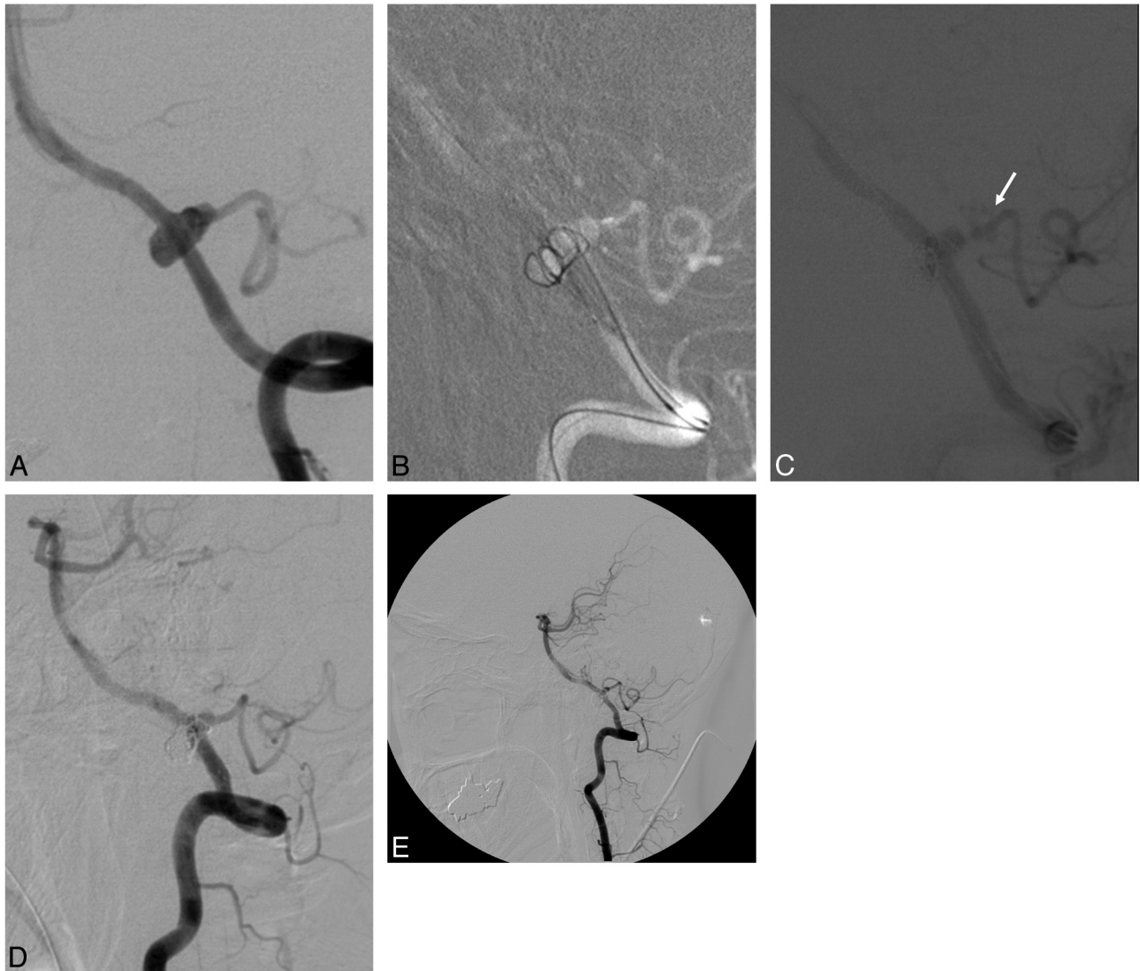
Fig 2. A 40-year-old woman with SAH. A , The left VA angiogram shows the circumferential aneurysm incorporated within the left posterior inferior cerebellar artery. B , The roadmap image shows the coil inserted into the circumferential aneurysm by using a Neuroform stent and balloon. C , Aneurysmal rebleeding ( arrow ) occurs during the procedure, and temporary occlusion of the parent artery is performed by using the balloon. D , After the second stent is placed into the stented parent artery, control angiogram shows partial occlusion of this aneurysm without rebleeding. E , Control angiogram 12 months after the procedure shows partial occlusion of the aneurysm without regrowth of the residual sac or coil compaction.

Our reconstructive endovascular procedure by using a combination of a stent and balloon was technically very successful (100%) with only 1 periprocedural complication observed among 20 patients (patient 5). Although 2 patients died, they presented initially with a poor HH grade of 5, and there was no evidence of postoperative rebleeding or infarction. Rabinov et al 10 reported a 20% postprocedural mortality rate for destructive endovascular treatment of vertebrobasilar dissecting aneurysms due to recurrent hemorrhage, vasospasm, global ischemia, or contralateral VA dissection. Fiorella et al 5 described 2 significant retroperitoneal hematomas and 2 brain stem infarcts in their constructive endovascular treatment of circumferential aneurysms by using the “balloon-in-stent” technique.