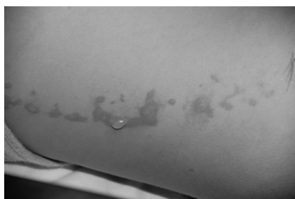
FIG 1. A linear erythematous blistering eruption is noted on the patient's right flank minutes after completion of the MR imaging of her brain and spine.

Note: —ETL indicates echo-train length; ST, section thickness; Sag, sagittal; Cor, coronal; STIR, short tau inversion recovery; TSE2d, turbo spin-echo 2d; TIR2d, turbo inversion recovery 2d; coil elements: H, head; N, neck; S, spine.