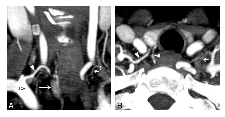
FIG 3. A 70-year-old woman with a right parathyroid adenoma. A , Coronal arterial phase image demonstrates an oval hyperenhancing adenoma in the right tracheoesophageal groove ( straight arrow ). Coronal ( A ) and axial ( B ) images show an enlarged inferior thyroid artery ( arrowheads ) arising from the right subclavian artery and terminating at the superior pole of the adenoma. Note the normal contralateral inferior thyroid artery ( curved arrows ).

fied the presence of a demonstrable blood supply from the inferior thyroid artery branches as a vascular arc surrounding the gland from 90° to 270°; in their series, 20 of 32 (63%) parathyroid adenomas had a color arc. Scheiner et al<sup>8</sup> reported finding a vessel draping over an adenoma in 65% of cases. The arterial phase of 4D CT allows radiologists to see the CT correlate of this well-established sonographic vascular finding.