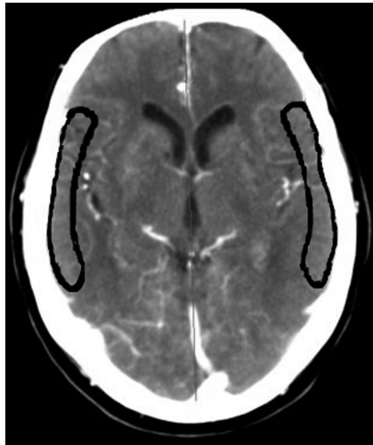
Fig 1. Manual outlining of middle cerebral artery territory on transverse CT sections, according to the maps of Damasio. 20

paired t test and the Wilcoxon signed rank test for 2 related samples. Subsequently, we analyzed differences between symptomatic and asymptomatic patients for both pre- and posttreatment values by using the Mann-Whitney U test for 2 independent samples. Statistical analysis was performed by using the Statistical Package for the Social Sciences, Version 15.0 (SPSS, Chicago, Illinois). A P value < .05 was considered statistically significant.