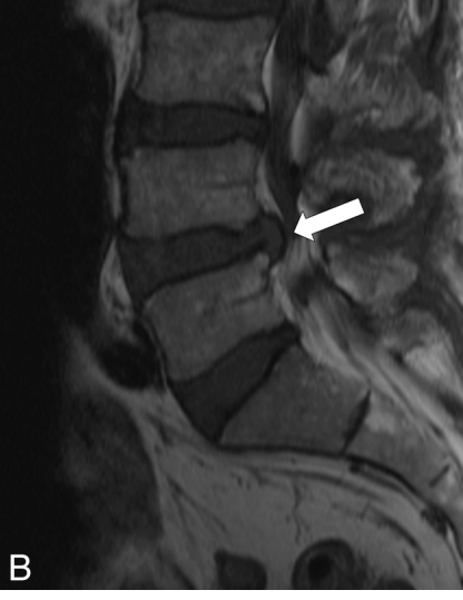
FIG 2. A 65-year-old man with a subligamentous HIVD at L4–5. TI-weighted axial ( A ) and TI-weighted sagittal ( B ) MR images (TR/TE, 500/10 ms) show the intact low-signal-intensity line covering the HIVD.