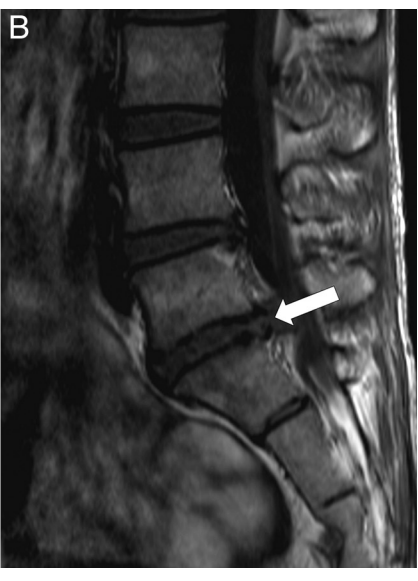
FIG 3. A 36-year-old man with an extraligamentous HIVD at L5-S1. A, T2-weighted axial MR image (TR/TE, 4200/100 ms) shows disruption of the continuous low-signal-intensity line covering the herniated disk ( arrow ) and the internal dark line ( arrowhead ). B, T1-weighted sagittal MR image (TR/TE, 500/10 ms) shows disruption of the continuous low-signal-intensity line covering the herniated disk ( arrow ).