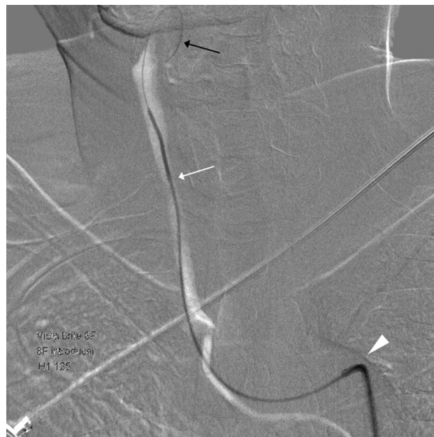
Fig 1. Carotid artery catheterization technique by using a coaxial system. Roadmap image shows a 0.035-inch guidewire inserted into the facial artery (black arrow), following a 5F headhunter catheter in the right CCA (white arrow) and an 8F guiding catheter crossing the aortic arch (arrowhead).

Other procedural steps were the same in both groups. All patients were premedicated with daily doses of 100-mg aspirin and 75-mg clopidogrel for at least 3 days before the procedure. Following the procedure, patients were continued on 100-mg/day aspirin indefinitely and 75-mg/day clopidogrel for at least 3 months. Therapeutic procedures were performed during a second angiographic session. The patients were fully awake during the procedures, and electrocardiography, arterial oxygen saturation, and blood pressure parameters were appropriately monitored. Percutaneous access was obtained via the right femoral artery, and a 7F-9F sheath was inserted. Baseline ACT was obtained before the procedure. The patients received a bolus injection of 3000- to 5000-IU heparin just before the start of the therapeutic procedure, with a boost of 1000-IU heparin administered every hour to provide an ACT >250 seconds or twice the baseline ACT during the procedure. A 7F-8F guiding catheter was positioned proximal to the stenotic lesion in the CCA by 1 of 2 carotid artery catheterization techniques. The length and stenotic rate of the stenotic segment were calculated manually, as well as automatically, on the basis of digital subtraction angiography according to the North American Symptomatic Carotid Endarterectomy Trial criteria. 19