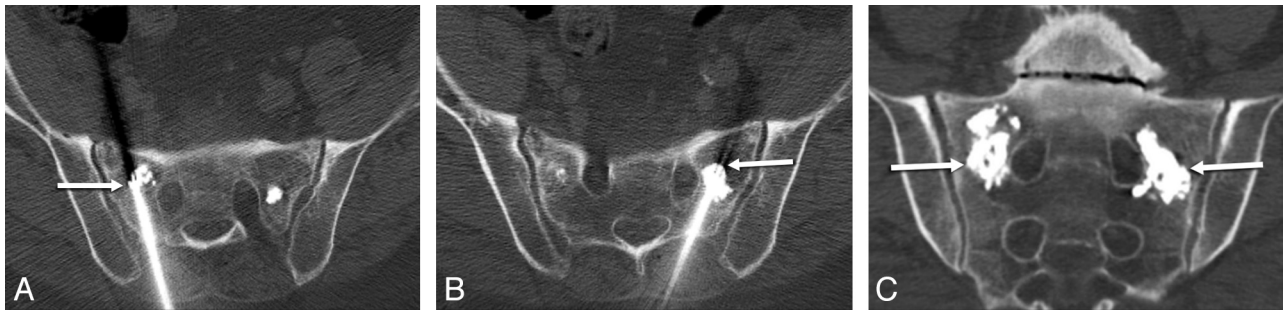
FIG 1. Percutaneous CT-guided sacroplasty. Intraoperative axial CT images during PMMA injection (A and B). The needle tip position is identified by the presence of beam-hardening artifacts (arrows) with adjacent PMMA deposition. Final postprocedural coronal CT image (C) reveals satisfactory PMMA deposition (arrows), with no extravasation into the sacral neural foramina.