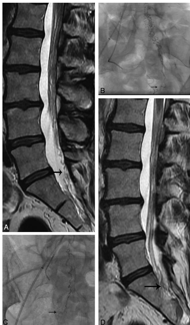
FIG 1. Patient 15, a 66-year-old man with a history of bilateral lower extremity weakness. A , Sagittal T2-weighted MR image shows multiple serpiginous flow voids (arrow) within the sacrum and lower lumbar spine. B , Left anterior oblique right lateral sacral angiogram shows site of SDAVF (arrow). C , Frontal spot fluoroscopic image shows glue cast within the arterial feeder, site of the fistula, and outflow vein (arrow). D , Sagittal T2-weighted MR image 6 months after treatment shows some interval resolution of the multiple serpiginous flow voids (arrow) within the sacrum and lower lumbar spine.

Wilcoxon signed rank test was used to compare pre- and post-treatment ALS gait and micturition scores, MC grading, and mRS scores. P values < .05 were considered significant. Because of the retrospective design and the small surgical sample size, no statistical comparison between the 2 treatment techniques was performed.