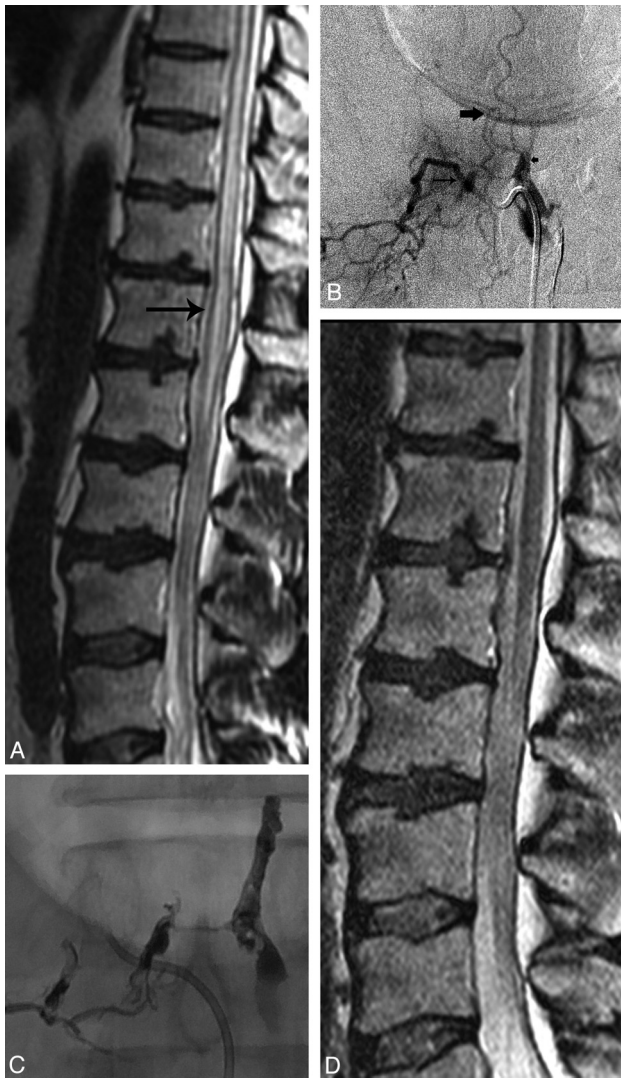
FIG 2. Patient 1, a 59-year-old man with inability to stand and persistent retention. A , Sagittal T2-weighted MR image shows high signal within the conus medullaris, lower and midthoracic spinal cord (arrow). B , Right T12 angiogram shows filling of an SDAVF (small arrow) with initial filling of the epidural venous plexus (small arrow), which then fills the radicular veins (large arrow). C , Frontal spot fluoroscopic images showing Onyx cast. D , Sagittal T2-weighted MR image 3 months after treatment shows interval resolution of the high signal within the conus medullaris, lower and midthoracic spinal cord.

embolization was attempted; however, there was poor penetration into the draining radicular vein and we were concerned about non-target embolization into the main vertebral artery, necessitating surgery. The fifth patient (Patient 16) had an SDAVF at L2 that was successfully treated with Onyx, with good penetration into the draining radicular vein. However, follow-up angiogram at 6 months demonstrated development of a collateral vessel to the fistula at L3, and surgery was therefore performed. One patient had improvement in motor strength on the ALS scale, and 4 (80%) of 5 patients demonstrated stable motor strength. According to MC grading, 2 (40%) of 5 patients had improvement and 3 (60%) of 5 had no change. On mRS assessment, 1 (20%) of 5 patients had improvement and 4 (80%) of 5 had no change.