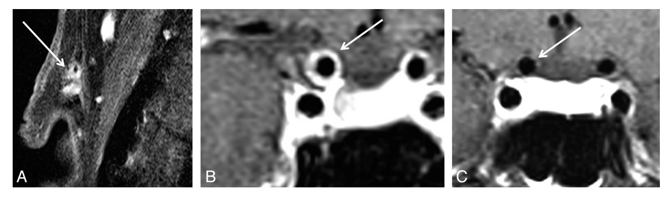
FIG 2. A patient with GCA with vessel wall enhancement of extracranial (A) and intracranial intradural internal carotid arteries (B). In contrast, patient with GCA without VWE of intracranial intradural arteries (C).

Note:-GD indicates gadolinium injection.