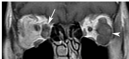
Fig 1. Coronal postcontrast T1-weighted image of the orbits in patient 1 demonstrates a heterogeneously enhancing ovoid lesion involving the right medial rectus (arrow). A similarly enhancing but larger lobulated lesion involves the left lateral rectus (arrowhead).