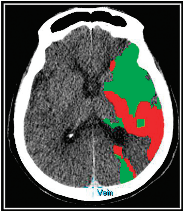
Fig 1. A 75-year-old patient with a left MCA ischemic stroke. Prognostic PCT map shows a mixed pattern of infarct core (red) and penumbra (green).

risk that was seen with the first-pass acquisition without delay correction (Table 2).