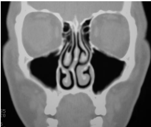
FIG 3. Coronal sinus CT of the patient obtained 10 years previously, before nasal septal reconstruction and rhinoplasty with lateral osteotomies, shows normal sinuses.

opmentally small sinus with chronic obstructive sinusitis was the cause (3). The acquired nature of this condition, however, is now well recognized. Negative intrasinus pressure has been demonstrated in patients with silent sinus syndrome (5). Obstruction of the sinus ostium is always present, but it is not clear whether this is the cause or the result of sinus wall