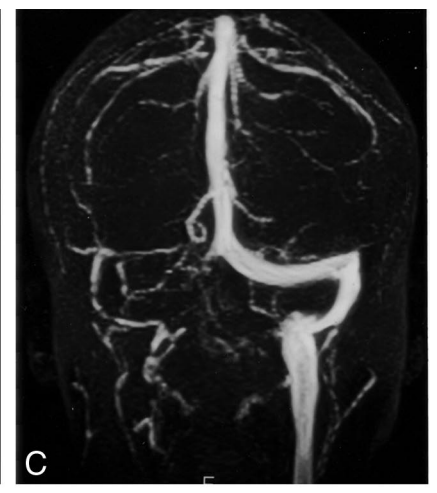
Fig 1. MR venography of the cerebral sinuses and its variations in the torcular herophili.