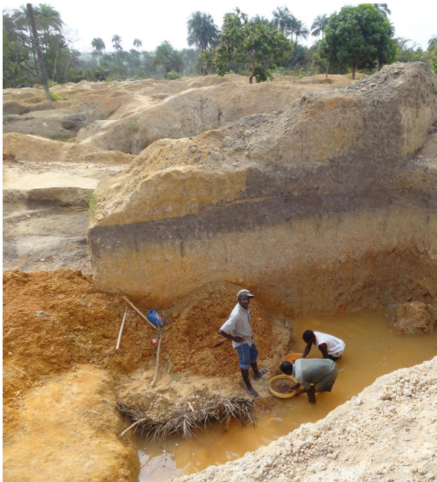
Figure 1. Placer mining for alluvial diamonds at the Kenenday mine site, Guinea, with artisanal miners washing gravels (7 March 2012).

Angola, Canada, and South Africa (Mining Technology, 2019). Diamonds occur in both kimberlite pipes, river-associated deposits on land, and shelf deposits under the ocean. In southern Africa, rivers transport diamonds to the western shelf of the South Atlantic Ocean (Garnett, 2002).