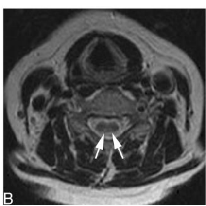
Fig 2. A and B, T2-weighted sagittal (A) and axial (B) images after copper supplementation show marked resolution of signal intensity (arrows) in the cervical spinal cord.

drome, and parenteral nutrition (without adequate copper), and this condition can rarely be seen in malnourished infants.