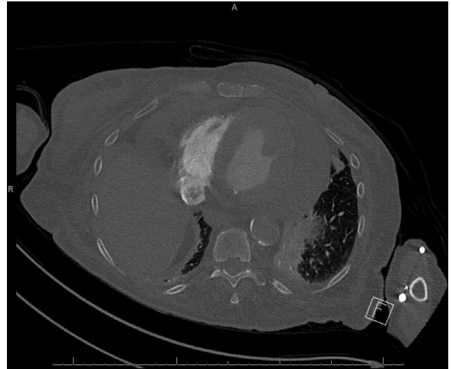
FIGURE 3 Computerized Tomography (CT) demonstrating large pericardial effusion