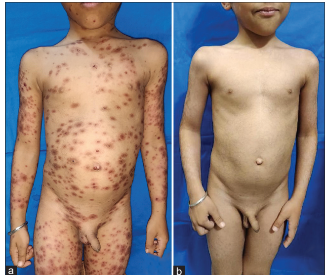
Figure 3: (a) Dusky erythematous macules and atypical target lesions all over the body in a child of Stevens-Johnson syndrome due to paracetamol. (b) Complete resolution of lesions at day 7 of cyclosporine treatment

The present understanding of mechanism of SJS/TEN involves activation of cytotoxic T-cells by a culprit drug with the consequent release of granulysin and activation of caspase cascade resulting in keratinocyte apoptosis. [18] Cyclosporine inhibits the activation of CD4+ and CD8+ (cytotoxic) T-cells in the epidermis by suppressing interleukin-2 production from activated T-helper cells. Cyclosporine has also been shown to inhibit TNF- \alpha production. TNF- \alpha is another key cytokine involved in the amplification of apoptotic pathways implicated in